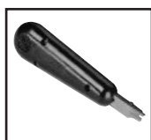
Punch-down Connecting Tool