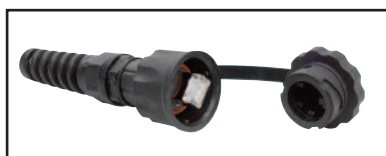
IP67 Plug Kit

IP67 interface complies with the EtherNet/IP specification (IEC 61076-3-106 Variant 1)