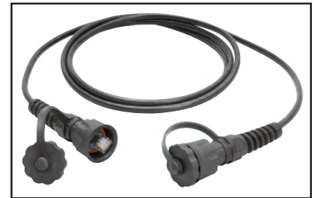
IP67 Cord Set

Unshielded with Stranded Conductors (ref: Belden Bonded-Pair Cable 7924A)