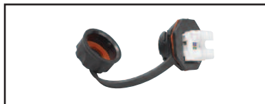
IP67 Modular Jack

IP67 interface complies with the EtherNet/IP specification (IEC 61076-3-106 Variant 1)