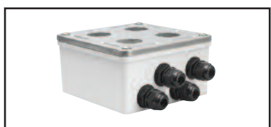
IP67 Surface Mount Box

Surface Mount Box Dimensions: 12.8 x 12.8 x 6.7 cm deep (5.05" x 5.05" x 2.625" deep)