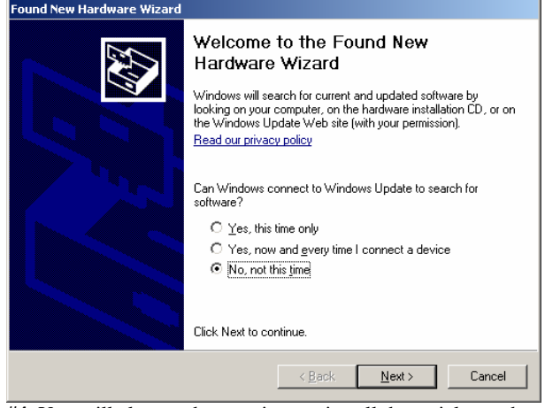
#4. You will also need to continue to install the serial port the same as installing the converter. Click the Next button followed by the Finish button. It will take a couple seconds for the serial port to be installed.