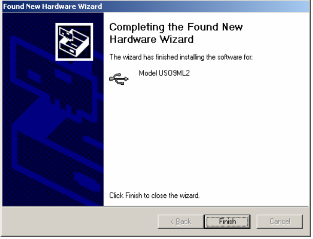
#3. The screen above will appear. Click the Finish button to complete the installation.